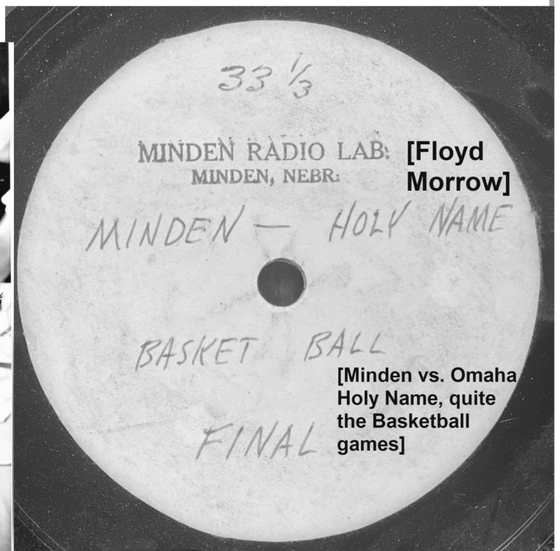
[Minden vs. Omaha Holy Name, quite the Basketball games]