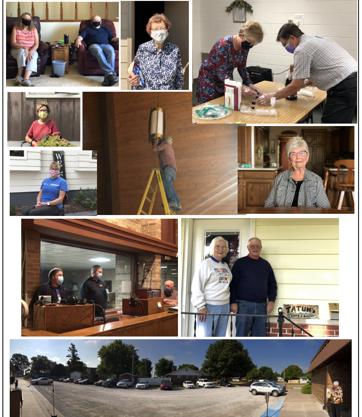
October 25th —Drive-In Worship Service - tune in to 90.3FM.