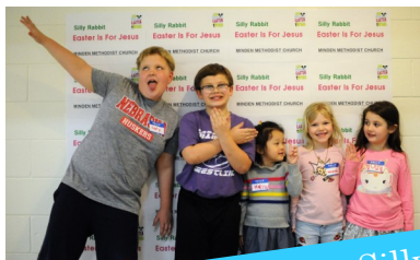
Kid's Night Out - Silly Rabbit Easter Is For Jesus