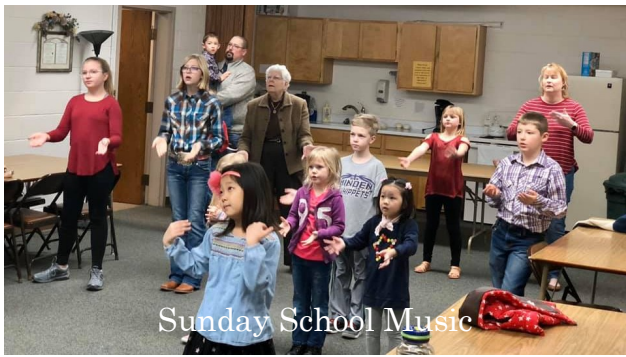
Sunday School Music