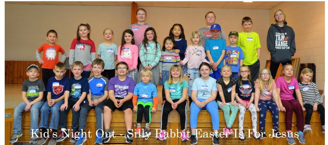
Kid's Night Out - Silly Rabbit Easter Is For Jesus