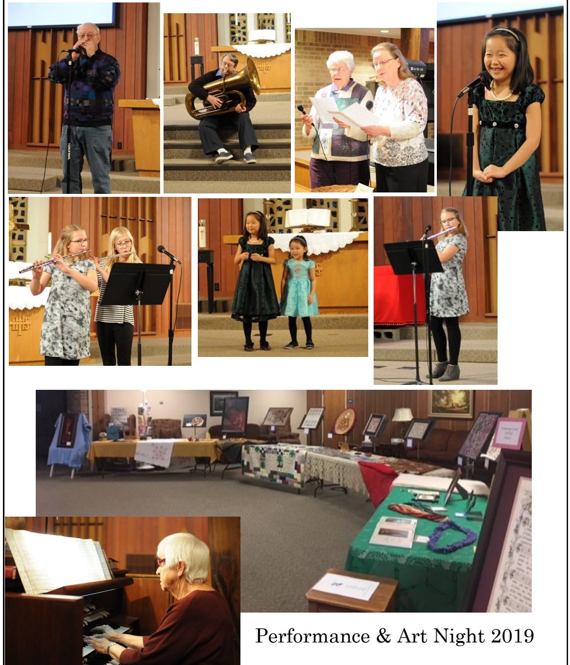
Performance & Art Night 2019