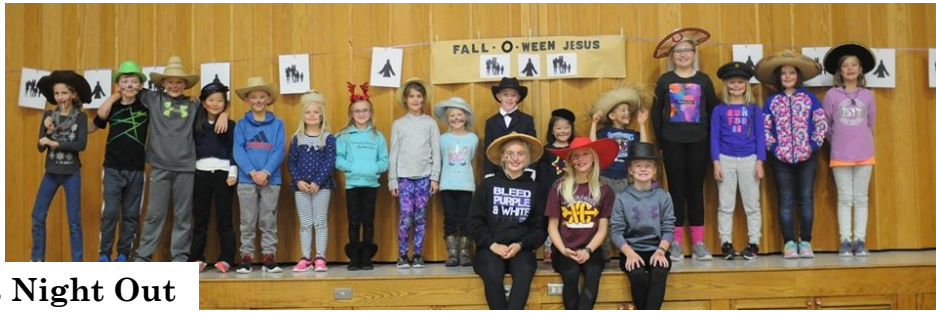
Kids Night Out