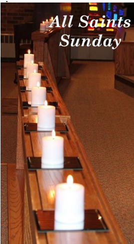
All Saints Sunday