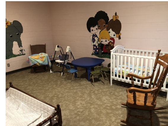
New Carpet in the Nursery