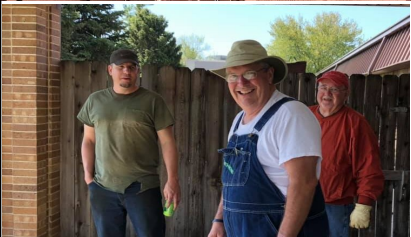
Church Spring Cleanup