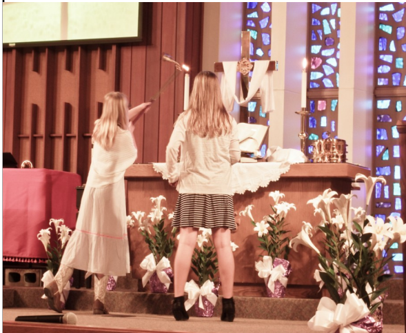
Lighting The Candles Easter Sunday