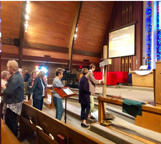
Good Friday-Nailing Our Sins to The Cross