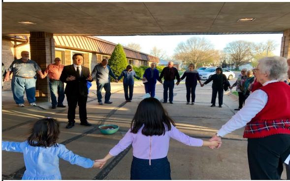
Good Friday-Burning Our Sins