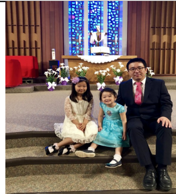
Easter Sunday-Christ Is Risen Indeed!