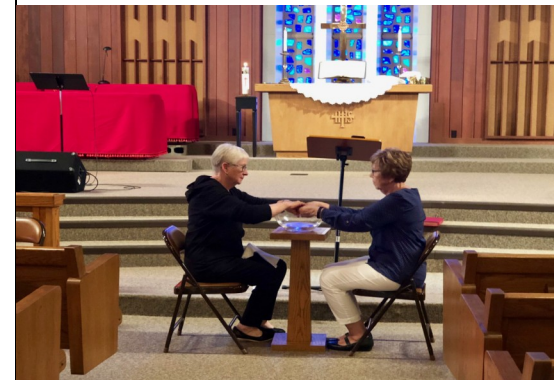
Maundy Thursday-Hand Washing