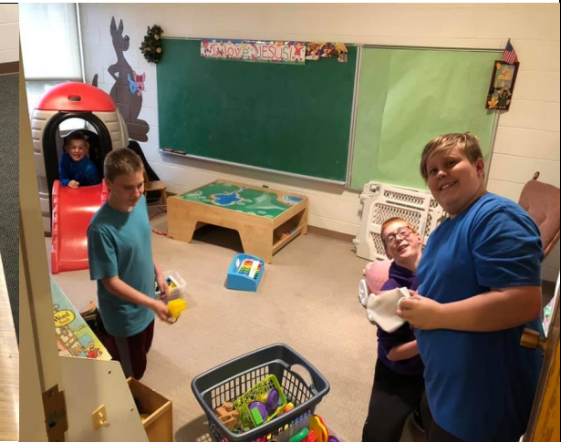
Cub Scouts Cleaning The Nursery