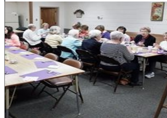
April UMW Meeting