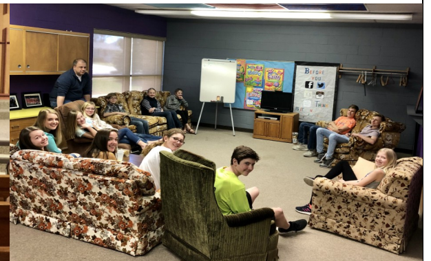
April Youth Meeting