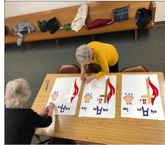
Making Baptismal Banners

My friends, there is nothing more beautiful, stronger or more fierce than a mother's love. Mothers think about their children day and night and will love them with a fierceness few people will totally understand. Her love can be as tender as a rose but as fierce as a thunderstorm! Consider the priceless value of her. Do you have a mother, grandmother, aunt, sister, good friend, or someone who is a mother figure in your life? Then be sure to thank her for her unending support, her humor, her advice, her patience, her sacrifice, her faith, her hope, and her fierce mother-love she has for you, and then praise God for her and thank Him for sending her into your life. A mother's love is so powerful that even God recognizes it and uses it as a metaphor for His love for us in Isaiah 66:13 - "As a mother comforts her child, so will I comfort you". Jw♥