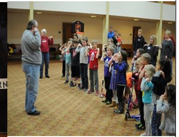
Kid's Night Out!