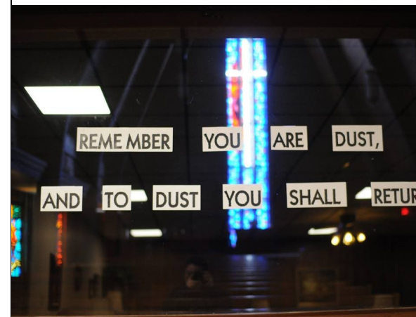
Preparing for Lent