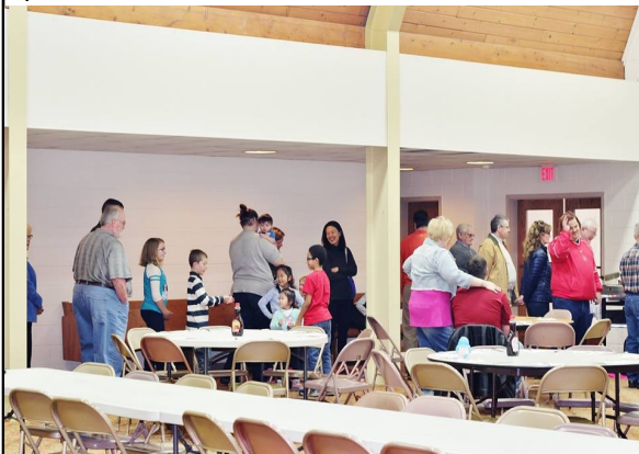
Pancake Feed, February 17 th