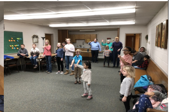
Opening Exercises for Sunday School