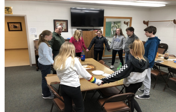
Time of Prayer during Confirmation Class