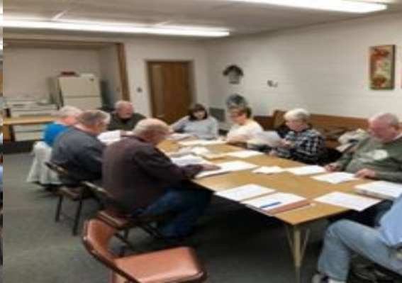
February Finance Meeting