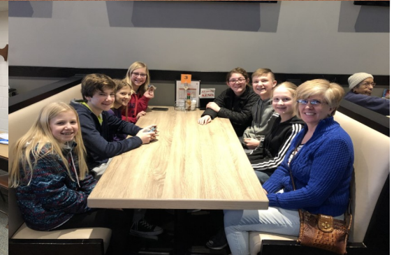
Fun outing for the Confirmation Class