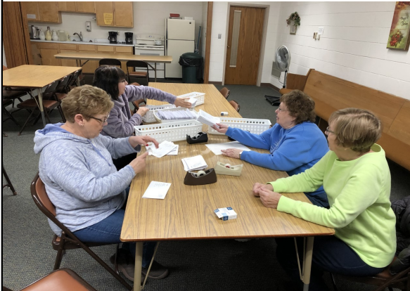
Getting the Newsletter ready for the mail.