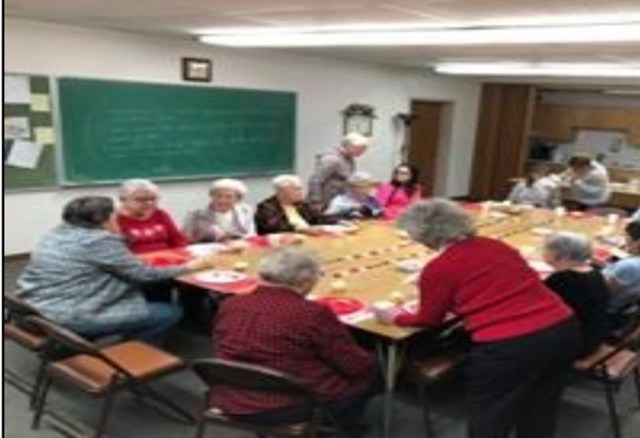
February UMW Meeting