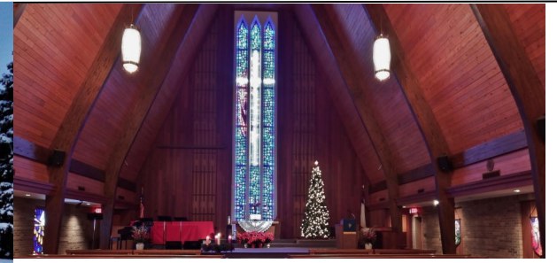
Decorated for the Advent Season