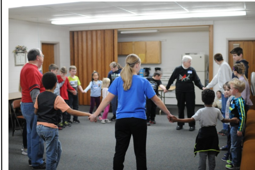
Kid's Night Out