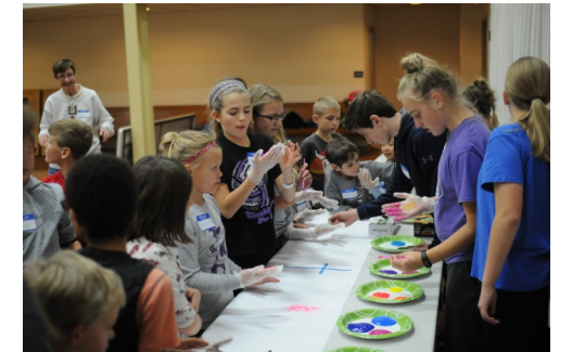
Kid's Night Out