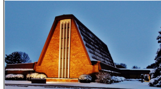
Our beautiful Church