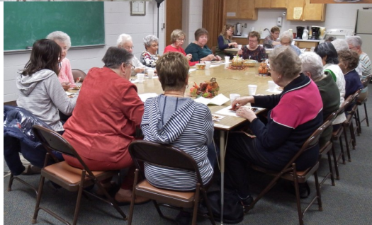
UMW November Meeting