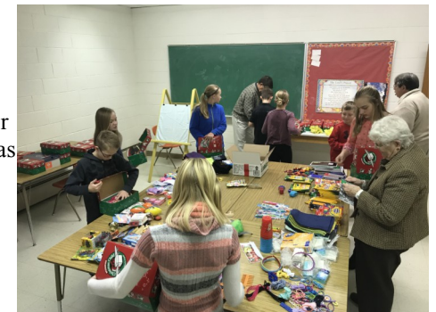
Packing boxes for Shoebox Christmas Gifts