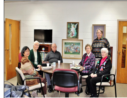
Adult Sunday School Class