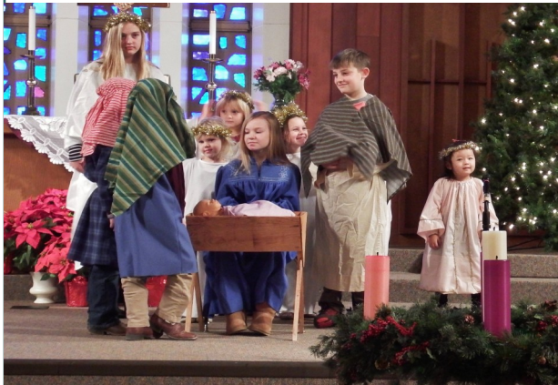
Children's Christmas Program