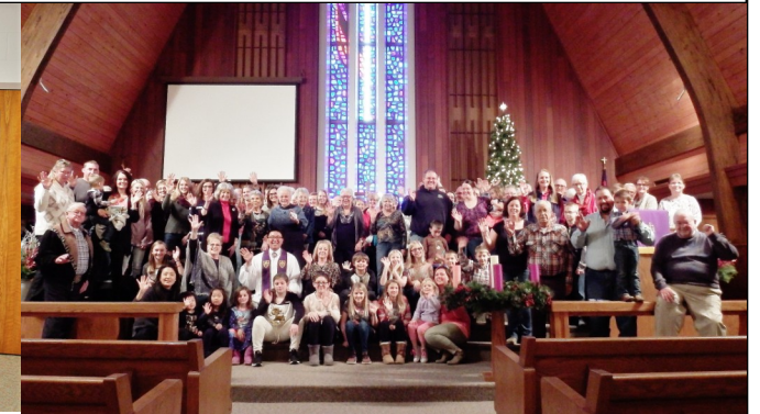
Greetings from our Congregation