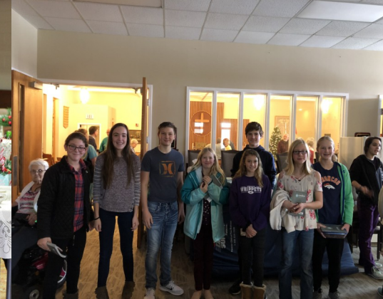
Confirmation Class visiting Bethany

I had incredible examples to "train" from! From Hebrews 13:7 - "Remember your leaders, those who spoke to you the word of God. Consider the outcome of their way of life, and imitate their faith." As I said, I was blessed with wonderful examples of Christianity from the time I was a wee babe through my childhood and onward which I know with certainty that they led me to know that God lives in my heart. From 2 Corinthians 5:17 - "Therefore, if anyone is in Christ, he is a new creation, the old has gone, the new has come!" How precious it is to know that when we have Jesus in our hearts, we are made new again! I believe in God not because my parents told me, not because the church told me, but because I've experienced His goodness and His mercy, myself. Our God is always seeking us. In every sunset, every clear blue sky, every ocean wave, every snow topped mountain, every starry night. He encompasses each day with the invitation, "I am here for you". Maybe He came into your heart as gentle as a floating feather or maybe He came into your heart with loud clanging cymbals. It doesn't really matter how He got there, it just matters that He's there. Jw♥