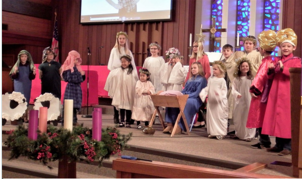
Children's Christmas Program