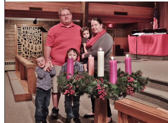
Havens' Family Lighting Advent Candles