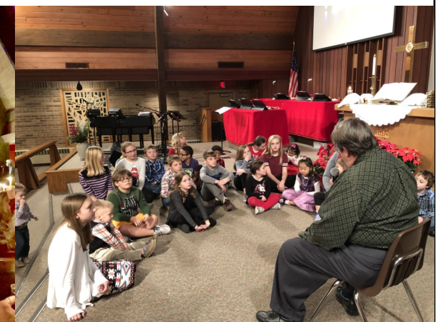
Christmas Eve Children's Time