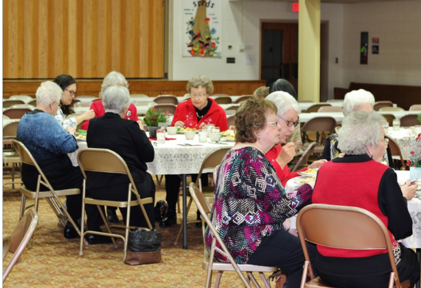
UMW Christmas Luncheon