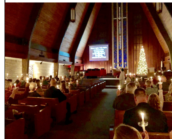
Candlelight Service Christmas